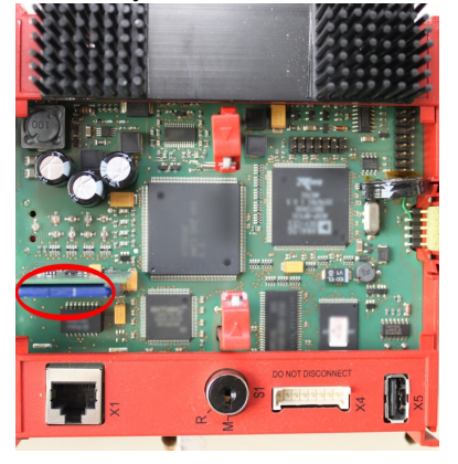
Table 7.1: The layout of a modern smart meter.

customers. Actually, there are even instruction videos how this can be done with a traditional meter using magnets.<sup>1</sup> The only difference with smart meters is that it needs the right piece of software for the modification instead of the right magnet. McLaughlin et al. [22] further describe the means how energy theft could happen.